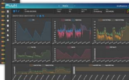
Battery 'Deep Dive'