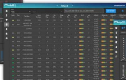
Weekly / Monthly Report